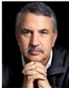
Thomas L. Friedman